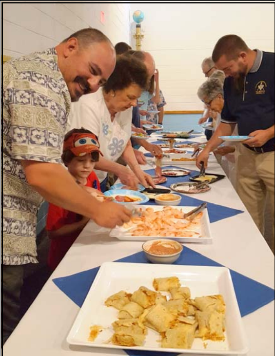
Our fabulous appetizer table