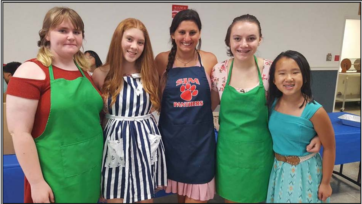
Rainbow Girls serve with a smile!

Las Palmas Dinner Serving - Heart of the Valley Assembly sends a special thank you to Las Palmas Building Association for your generous donation.