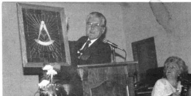
Grand Master with gift of stained glass with Grand Master Insignia molded into it.