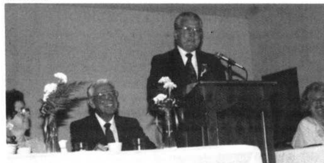
Grand Master addresses group telling of propositions to be presented at Grand Lodge Communication.